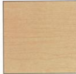
Hard Rock Maple