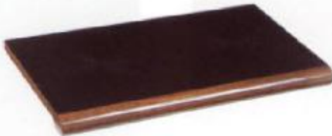
Style No. FIN#2 Surface coverage - woodgrain or marble on bullnose & sides