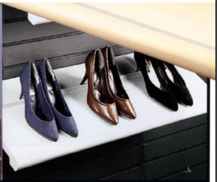
ROUTED SHELVES WITH ACRYLIC BANDING