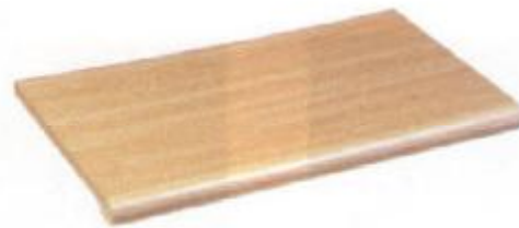
Style No. FIN#3 Surface coverage - woodgrain or marble on top, bullnose & sides